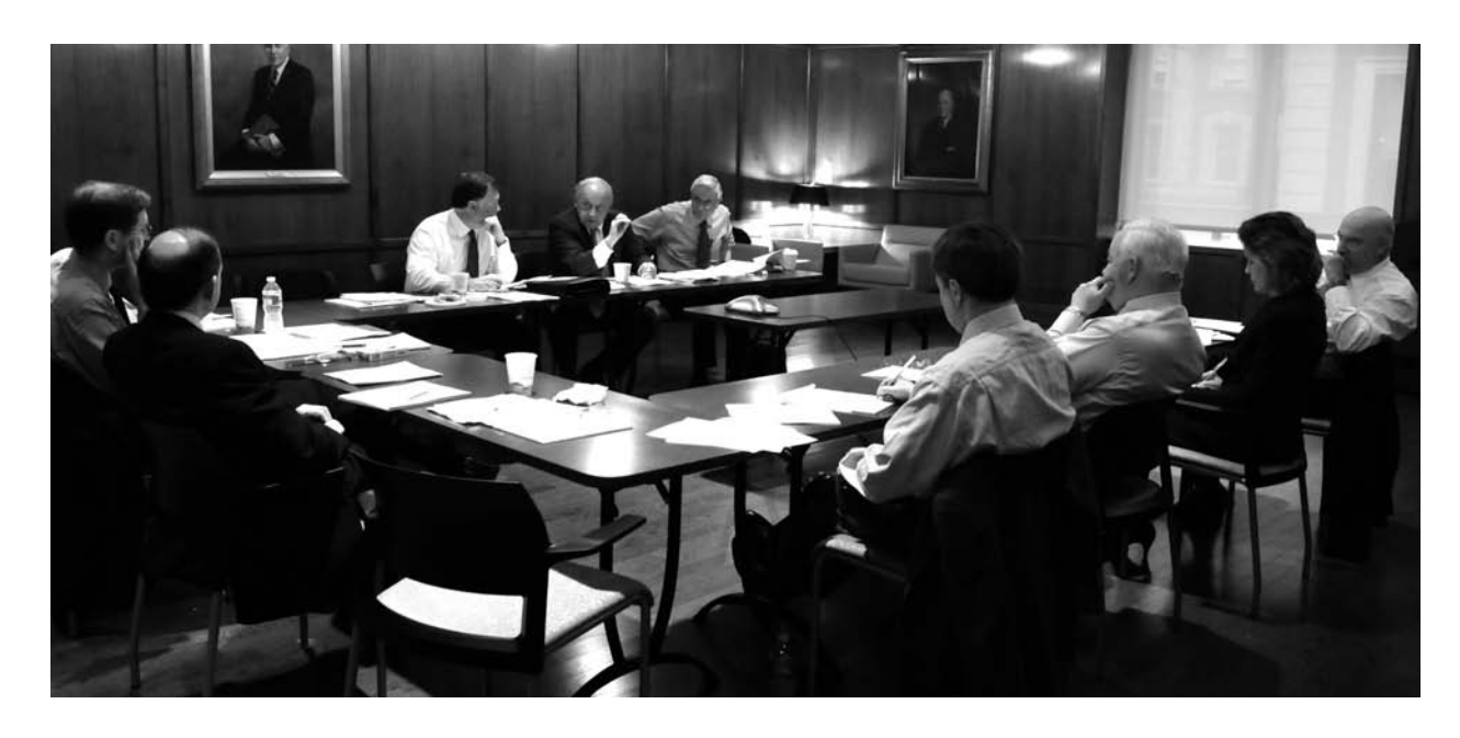
The following quotes are from Study Group discussions and correspondence.